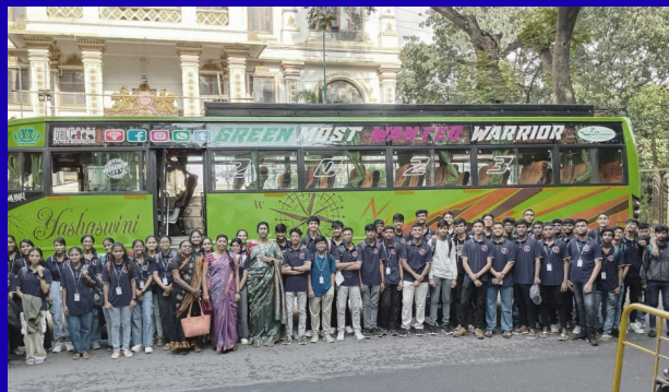
International Yoga Day Celebrations:

Our college prioritizes the holistic development of students, and yoga classes play a crucial role in promoting physical, mental, and emotional well-being.