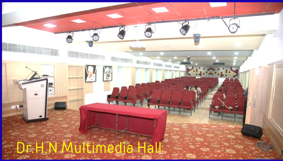
Dr.H.N Multimedia Hall